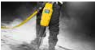
7 bar: Handheld tools