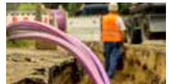
12 to 14 bar: Cable blowing and drilling