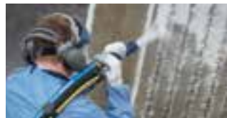
8.6 to 10 bar: Abrasive blasting