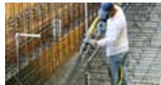
7 to 12 bar: Shotcrete applications