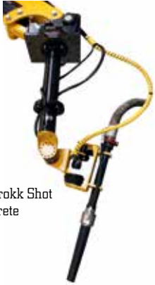
Brokk Shot Crete