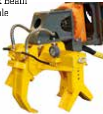
Brokk Beam Grapple