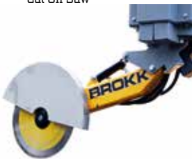
Cut Off Saw