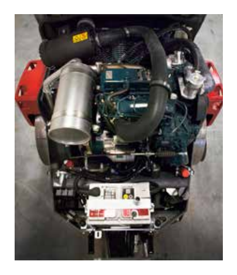
Kubota 26kW IIIA/T4i Kubota 28kW T4f Kubota 18,5kW T4f